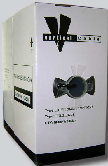
Dimensions 21H x 21L x 9W (inches) (Packaging may vary)