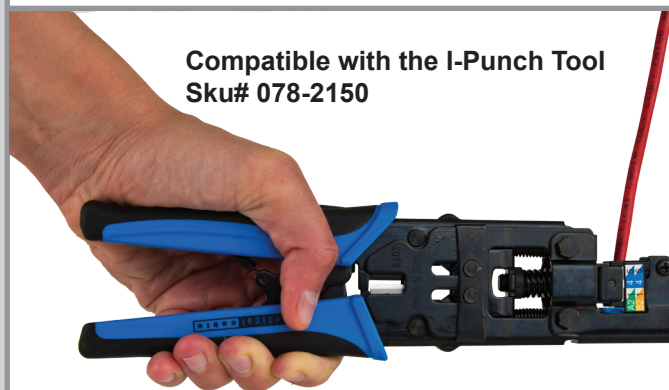
Compatible with the I-Punch Tool Sku# 078-2150

Insertion Force: 20N max. (IEC 606037-4) Retention Strength: 7.7 kg between jack and plug Operating Temp: -10°C to 60°C max